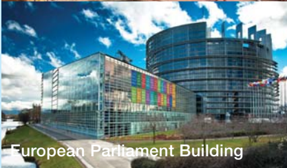
European Parliament Building