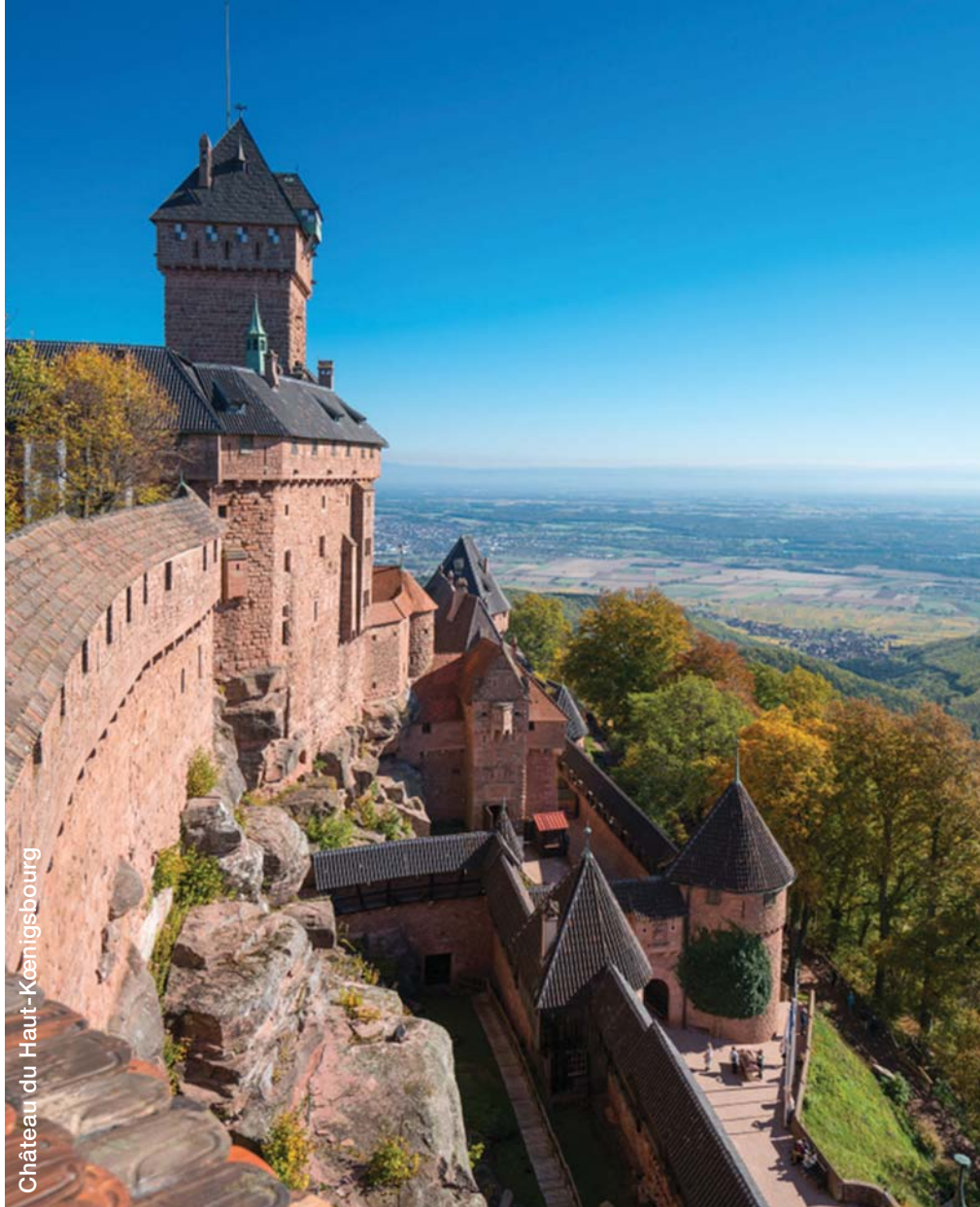
Château du Haut-Kœnigsbourg

Flight details may be subject to change. Price based on twin share. Minimum number of 17 travellers required. Normal booking conditions apply.