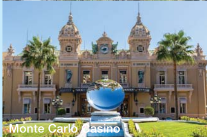
Monte Carlo Casino