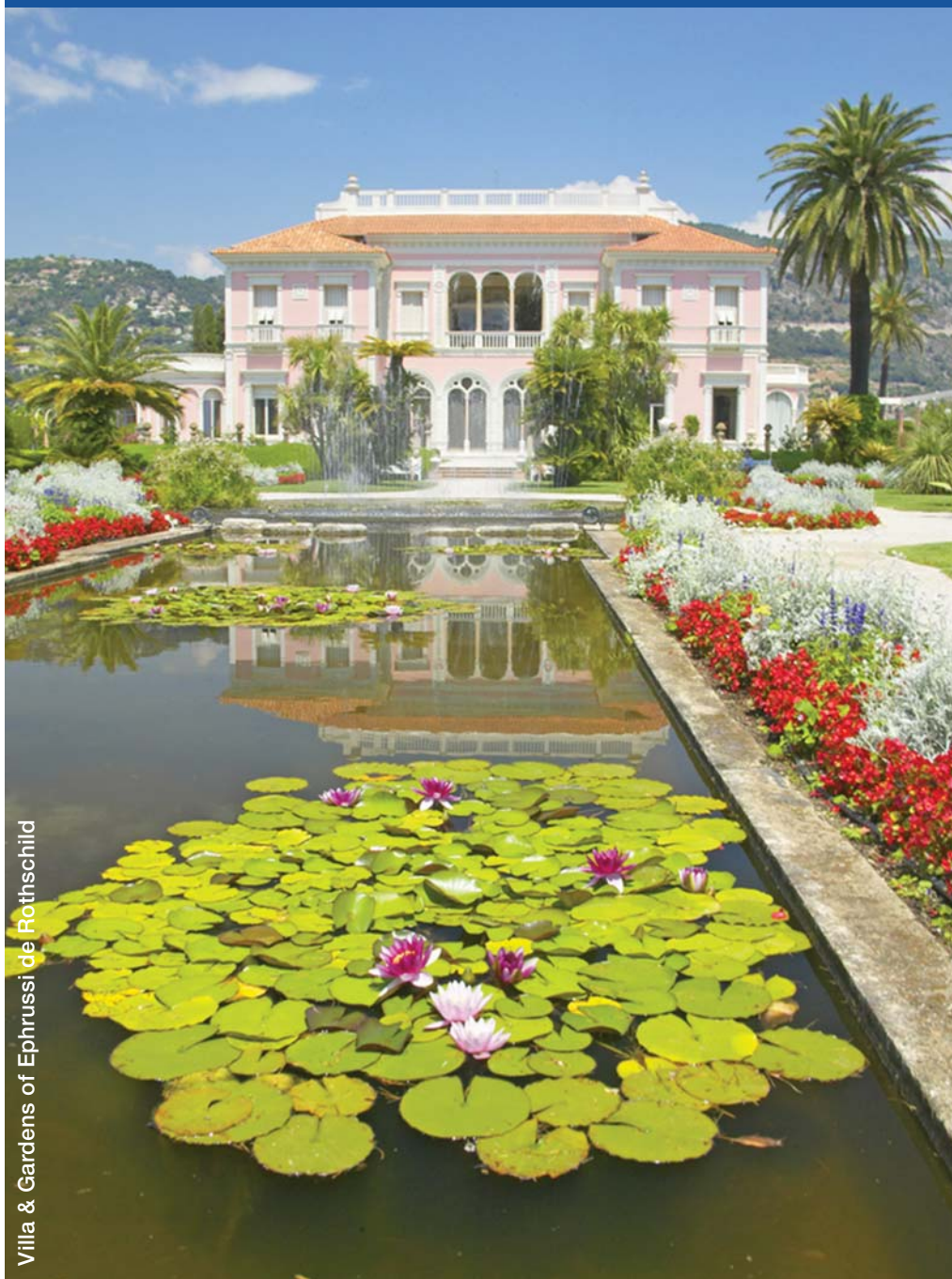
Villa & Gardens of Ephrussi de Rothschild

4 days from £1,345 Departs 14th May 2017