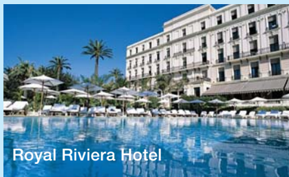
Royal Riviera Hotel